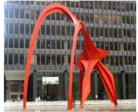
Alexander Calder's Flamingo