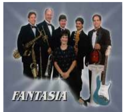
Appearing at the Association Grand Banquet